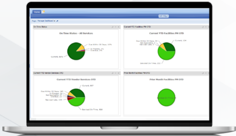
Manager Dashboard in CERDAAC